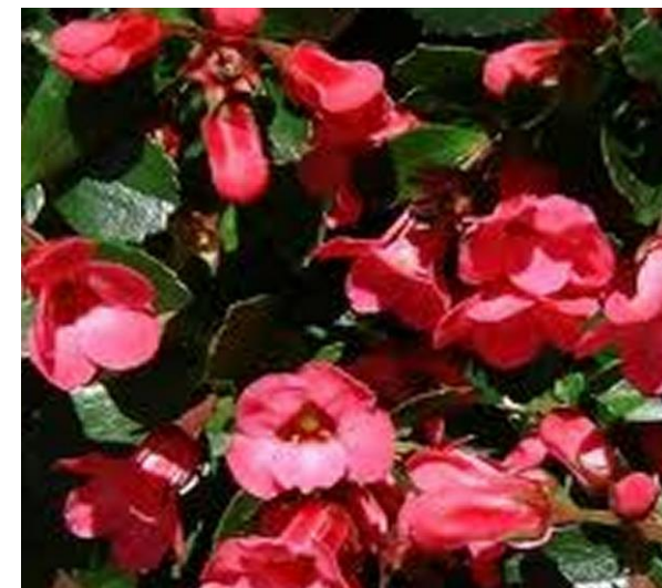
Below: Escallonia Red Hedger.