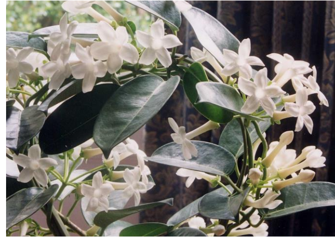
Left: A coiled stephanotis in a conservatory pot.

In spring, after flowering has finished, many people consider they have had their money's worth and throw the plant away. But anyone with a conservatory or heated greenhouse can provide long-term care with the aim of bringing the plant into flower again. The roots will probably be filling the pot in spring, so it is best to replant into a larger pot, about 4cm (1.5in) wider and deeper, using a loam-based compost such as John Innes No 2.