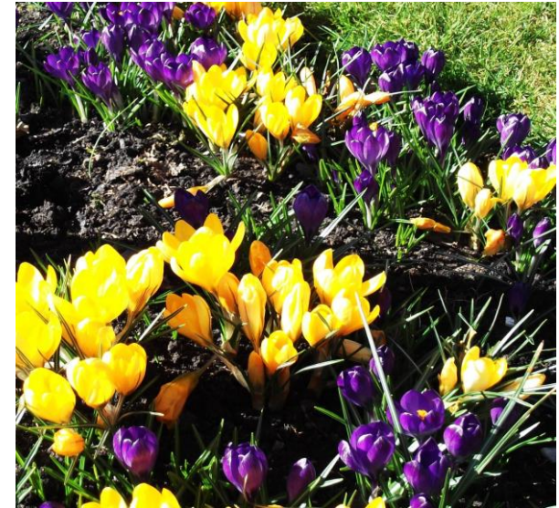
Right: Purple and golden crocuses in a border.

Most crocuses are scented, a quality that is easier to appreciate when they are grown in bowls for indoor display in winter. There are also delightful autumn-flowering species – true autumn crocuses, not to be confused with colchicums. Among them are Crocus speciosus , which self-seeds freely so is excellent for naturalising around shrubs or in grass. The flowers are in shades of violet-blue with darker veins and long orange styles protruding from the centre. Less familiar is Crocus cartwrightianus , white or lilac with purple veins and scarlet styles.