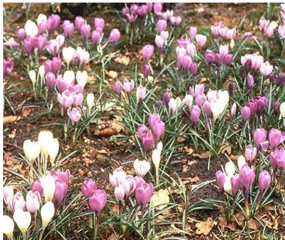
Left: White and purple crocuses in woodland semi-shade.

The name comes from krokos , the Greek for saffron, derived from the Hebrew karkom , referred to in the Song of Solomon. Different species originate in Europe, Asia and North Africa but most come from the Middle East. There are numerous attractive hybrids such as Gypsy Girl, which has large yellow flowers with feathered purple stripes on the outside, and Princess Beatrix – obviously Dutch, like many of the hybrids – a clear blue kind with a yellow base.