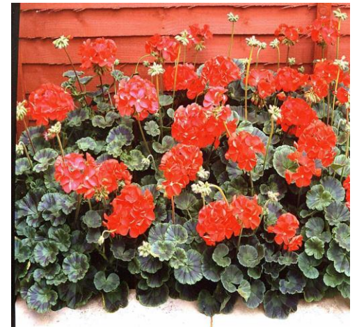
Above left: Pelargonium Royal Dazzler.