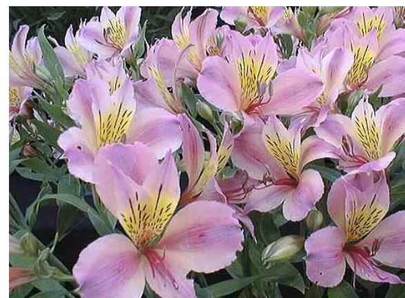
Left: Alstroemeria Parigo Charm.