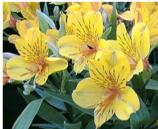
Above: An Alstroemeria ligtu hybrid.

Alstroemerias are named for Clas Alströmer, a Swedish naturalist who travelled in the late 18th century collecting plants for Carl Linnaeus, who is famous for having devised the binomial (two-word) system of plant-naming – first the genus, such as Alstroemeria , then the species, such as ligtu . The adoption of this system worldwide saved endless confusion, enabling botanists and horticulturalists in different countries to understand each other.