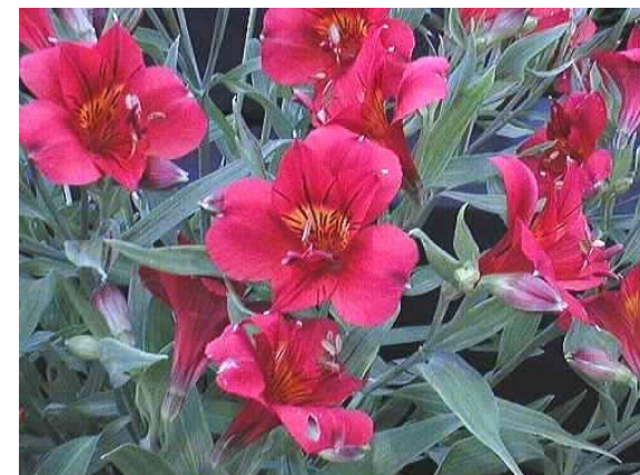
Right: Alstroemeria Margaret.