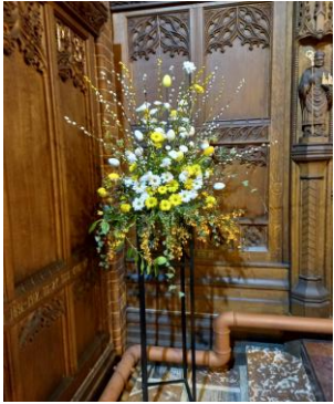
Flowers arranged by members of St Hildeburgh's Guild – Easter 2023

St Hildeburgh's Guild AGM will take place in the Church Centre small meeting room on Monday 11 March 2024 at 10.30am.