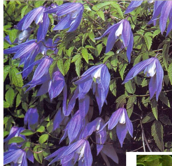
Pictured left: Clematis alpina .

The word clematis seems to have come from the Greek klema , meaning "tendrils," with which, of course, the climbing species cling to their supports. Remember that when preparing a position for a new plant - fix wires or trellis into position making sure they are sturdy enough to hold the weight of a full-grown climber.