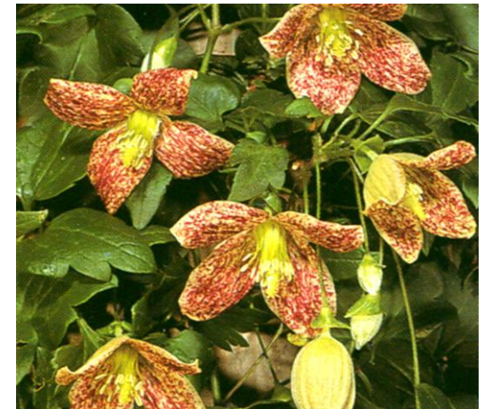
Pictured below: Clematis cirrhosa 'Freckles'.

If planting against a wall or fence, select a position at least 45cm (18in) away from it. Immerse the roots, still in their container, in water for 20 minutes and, while the rootball is soaking, dig a hole 45cm deep and wide (18in x 18in).