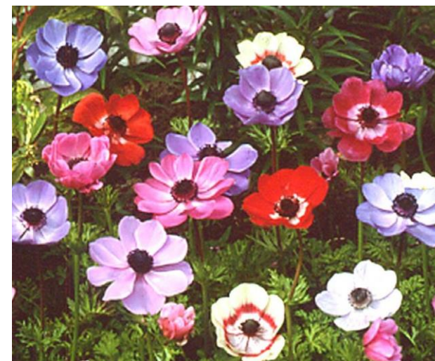
Below: Anemone coronaria varieties.