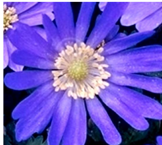
Left: Anemone blanda.

Both groups should be planted in a sunny position in light soil – sandy, if possible – that dries out in summer after the anemones have flowered to give them a dry period of dormancy. They need generous mulching to protect the tubers through winter. In gardens which have wet or heavy soil, or are particularly exposed to the elements, Anemone coronaria tubers are best grown in pots of sandy compost that can be protected through winter. Pests and diseases rarely attack the plants but mildew occasionally infects leaves and young shoots can be eaten by slugs and snails.