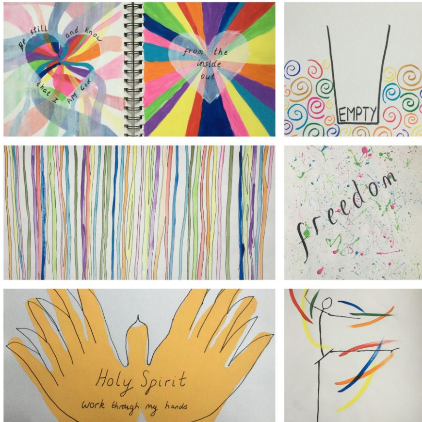
Above: art collage courtesy of Alice Price

or follow @artforthesoulhoylake on Facebook.