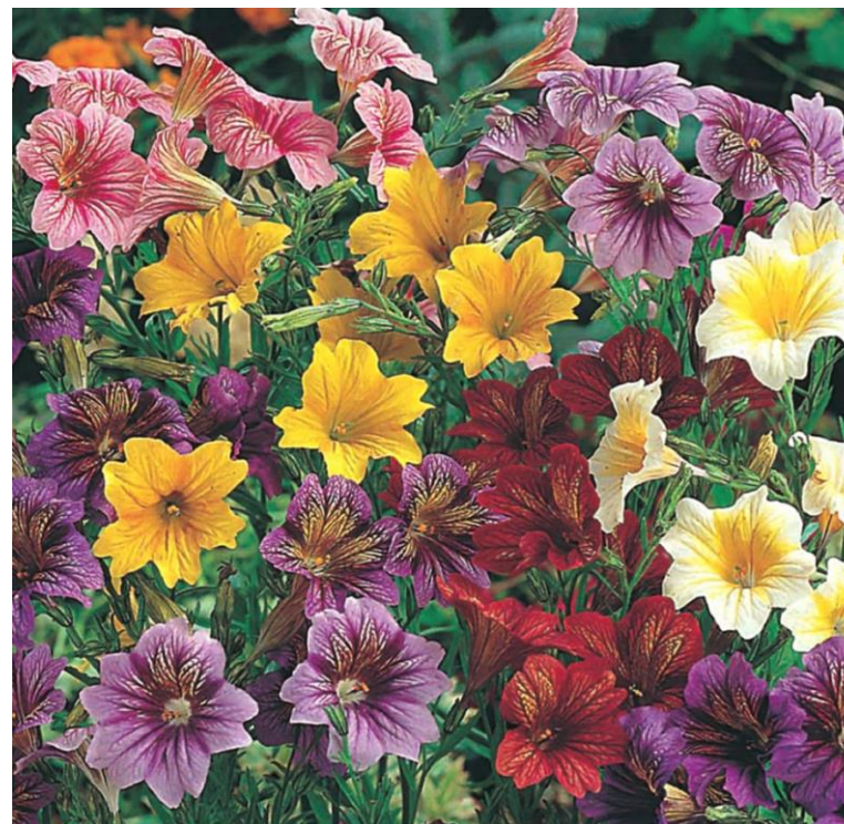
Above: Salpiglossis Little Friends.

The best kinds, which can reach 30cm (12in) in height and 60cm (24in) in spread, include: the Casino Series, with veined blooms of yellow, orange, red, blue and purple; Black Trumpets, which are actually deep crimson with darker veins; the very striking Superbissima Mix in various colours, each with an explosion-like show of golden flame markings on the upper petals; the Little Friends mixture (pictured), in paler colours than some but with the golden-flame patterns on many of the flowers; and Kew Blue, velvety purple and heavily veined.