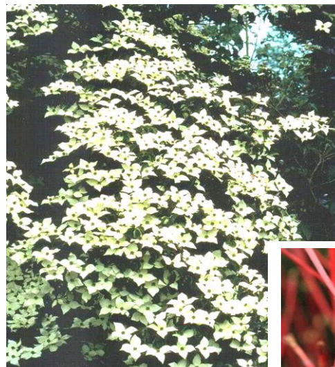
Left: Cornus kousa ‘China Girl’

These dogwoods are rampant, hardy shrubs which quickly regrow new shoots however hard they are pruned. That is a clue to achieving the best winter colour. The youngest growth gives the most vivid colour, so the key to success lies in cutting back this year’s colourful stems while they’re still looking brilliant – in March. If this seems a pity, console yourself with the thought that they’ll look as good, if not better in the coming winter. For the fullest display cut the stems back to within 2.5cm (1in) of their base. For a more restrained show, prune to 30cm-60cm (1ft-2ft) from the ground. As well as helping to ensure more stunning stems next winter, pruning also keeps the plants under control.