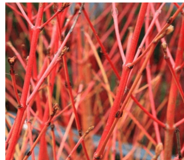
Right: Defying winter – the scarlet stems of Cornus alba ‘Sibirica.’

After removing so much of the vigorous growing material, it is critical to give the plants plenty of general fertiliser sprinkled round the base during mild weather in winter or early spring. Top this off with a layer of well-rotted manure or garden compost to add more nutrient and also help to maintain the moist, cool soil conditions that dogwoods prefer. If manure or garden compost are not available, use chipped bark. Although dogwoods grow best in dampish soil, they are tolerant of a wide range of conditions.