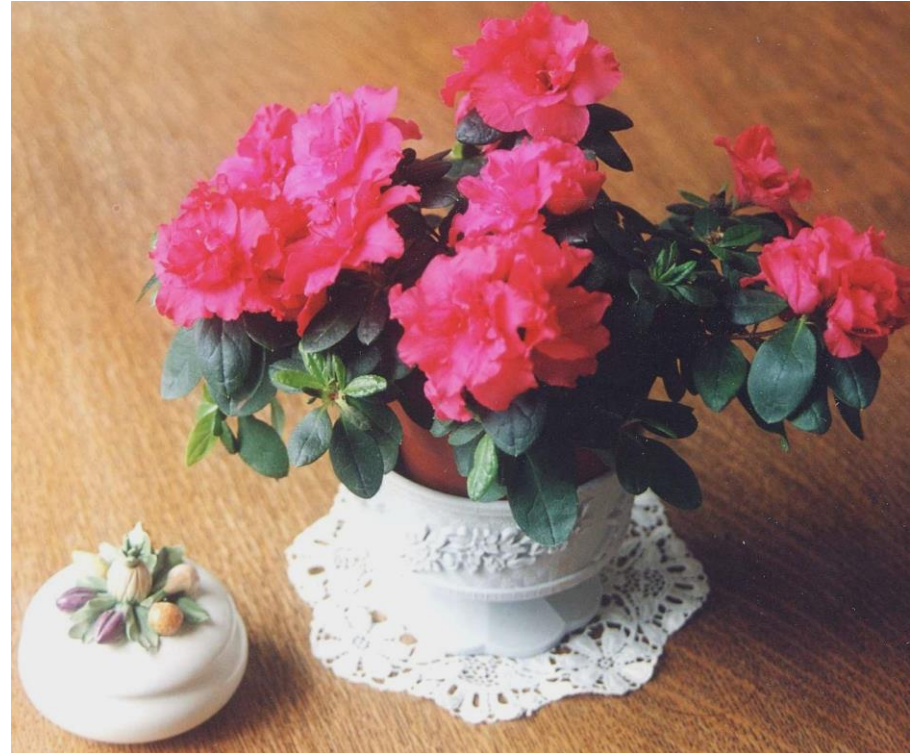
Above: A rose-pink Indian azalea

With correct care, azaleas will flower for a long period and can be brought into bloom again the following year. People buying a plant should choose one with a few flowers open and numerous buds. The plants should not be repotted, which is usually a good practice with newly-acquired pot plants, because azaleas bloom best when pot-bound. They should be kept well-watered in a cool, bright position. The rootball should not be allowed to dry out but neither should the pot be left standing in water. Most problems, such as premature flower-drop or shrivelled leaves, are caused by hot, dry air (so not near a radiator) or by underwatering. Misting the leaves with water regularly and standing the pot on a tray of gravel kept permanently moist can raise humidity and help the plant thrive.