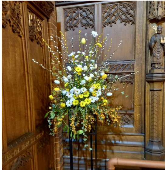
Flowers arranged by members of St Hildeburgh's Guild – Easter 2023

St Hildeburgh's Guild AGM will take place in the Church Centre small meeting room on Monday 11 March 2024 at 10.30am.