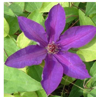
Above Left: Clematis Nelly Moser.