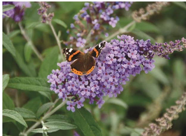
Left: A peacock butterfly feeding on nectar of buddleia Royal Red...

Buddleia davidii is a quick-growing shrub that flowers on current year's growth so it is pruned hard – to within a foot or so of the ground – in late March or April for the best flowers. Average height is around 2m (6ft 6in) though the arching branches spread somewhat wider. Left unpruned, a shrub will produce smaller flowers on top of a 2.4m-3m (8ft-10ft) bush. It blooms from July to September. Successional flowering can be encouraged by pruning back to new sideshoots as the leading flower head on each branch fades. The choice of colours is wide. Some of the best include Buzz (pictured); Black Knight, which is dark purple; Charming, lavender-pink; Empire Blue, violet-blue; Royal Red, purplish-red (pictured); and Fortune, lilac-blue. Good white varieties are White Profusion and Peace, which has 50cm (20in) spikes of white flowers with an orange eye.