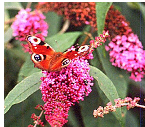
Right: ...and a red admiral feasting on Buzz.

There are two other popular garden species: Buddleia globosa , not quite as hardy, flowers in early summer, bearing dense balls of orange or yellow flowers on a shrub that can grow to 5m (16ft). Buddleia alternifolia has long, trailing branches covered in small, mauve sweetly-scented flowers which are borne on the previous year's growth. If trained as a standard it is elegant all year and stunningly beautiful when in bloom. It can reach 3.6m (12ft) but can be kept smaller by pruning. All three kinds can be propagated from cuttings, Buddleia davidii in autumn and the other two in summer.