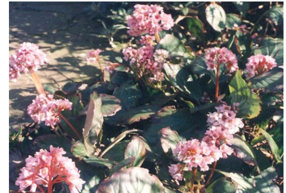
Right: Grow anywhere – a bergenia border in Hoylake sand.

If you have a friend or neighbour whose bergenia you admire, November is the time of year to ask for root cuttings. The method is simple: cut away a length of rhizomatous root – there'll be plenty growing on the surface – slit it into 1cm (half-inch) slices or cubes, and bury these in moist peat or peat substitute in a shallow pot or a seed tray. Put this in a clear plastic bag in a greenhouse or a light room. Each slice will produce a new plant which can be planted in a nursery bed in April and moved into its final flowering position in September.