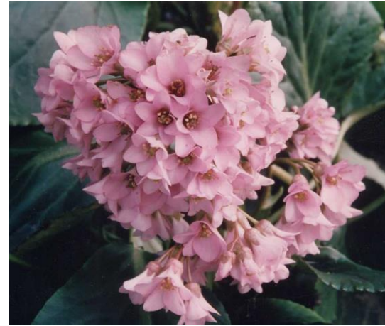
Left: Winter warmer – the rich pink of Bergenia cordifolia.

The most common species are Bergenia cordifolia , taller than most with pink flowers, and Bergenia purpurascens with purple autumn leaves followed by mauve blooms. There are many hybrids such as Baby Doll, free-flowering with elegant, drooping blooms; Ballawley, with red leaves in winter followed by rose-pink flowers (but not the hardiest variety); Silberlicht, with white flowers and pink-tinged leaves; Sunningdale, a free-flowering mauve variety; and Bergenia x schmidtii , which has large, pink flower-heads and is the earliest to bloom but not the easiest to obtain.