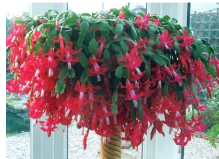
Left: Christmas cactus.

AMARYLLIS , also known as hippeastrum, are stunning distant cousins of the daffodil with huge flowers, orange, purple, white, pink or red, which provide a display of sumptuous satiny blooms over the festive season. The finest varieties include Picotee with white satiny petals edged in vivid red; Vera (pictured) which has flamboyant scarlet flowers; and Apple Blossom with white flowers etched in pink. They grow best if watered before the compost dries out and kept in bright light. The name comes from the Greek Amarullis , a name for a country girl in pastoral poetry. It means to sparkle or shine.