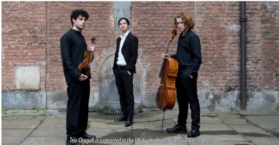
Trio Chagall is supported in the UK by the Young Classical Artists Trust

Schumann: Piano Trio No 1 in D minor, Op 63