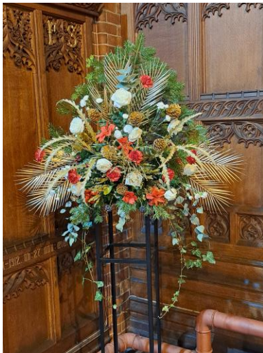
Pictured left: Christmas flowers at the altar arranged by members of St Hildeburgh's Guild.