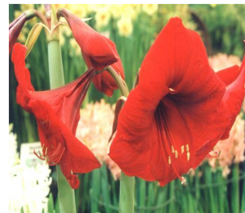
Above left: Hippeastrum Apple Blossom. Above right: Hippeastrum Red Lion.

Hippeastrums grow in most well-drained proprietary composts. Keep the pots in a minimum temperature of 13C (55F), in good, indirect light during the flowering period. Apply a general liquid fertiliser every week from the time the flowers fade until growth begins to slow – the older leaves will begin to turn yellow – or add a sprinkling of slow release fertiliser granules to the compost at planting time. Good light is necessary if the bulbs are to build up sufficient reserves for flowering in the following year. This can be achieved by setting the pots outdoors once all risk of frost has passed, or moving them into a greenhouse or bright room.