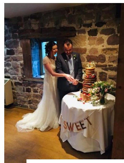
Cutting the amazing cake! Yes – those are really Lego figures!