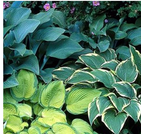
Above: Striking foliage – a range of colourful hosta leaves.