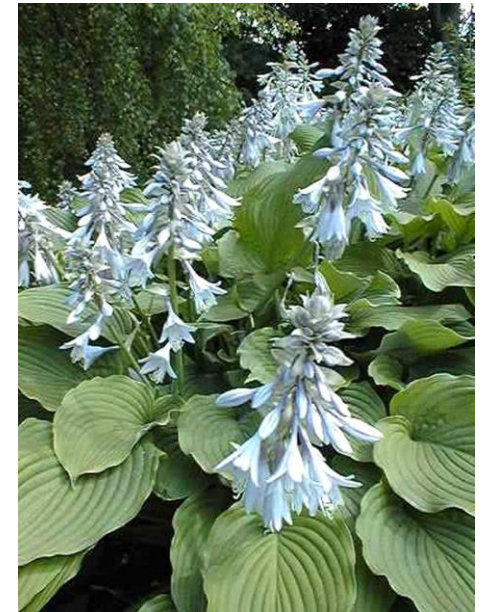
Right: Summer elegance – Hosta sieboldiana Elegans.