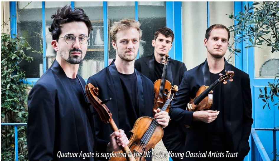
Quatuor Agate is supported in the UK by the Young Classical Artists Trust

Mozart - String Quartet No 21 in D major, K575 Korngold - String Quartet No 1 in A major, Op 16 Beethoven - String Quartet No 9 in C major, Op 59 No 3