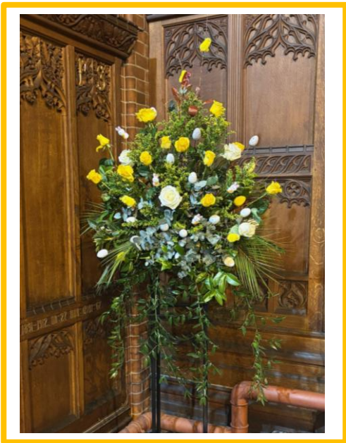
Below: members of StHildeburgh's Guild who created these beautiful Easter arrangements.