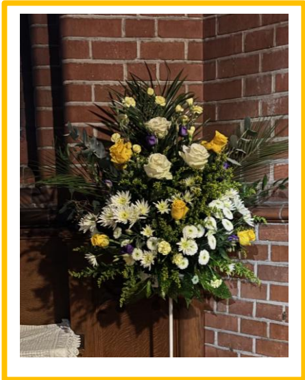
Far left: Lady Chapel steps.